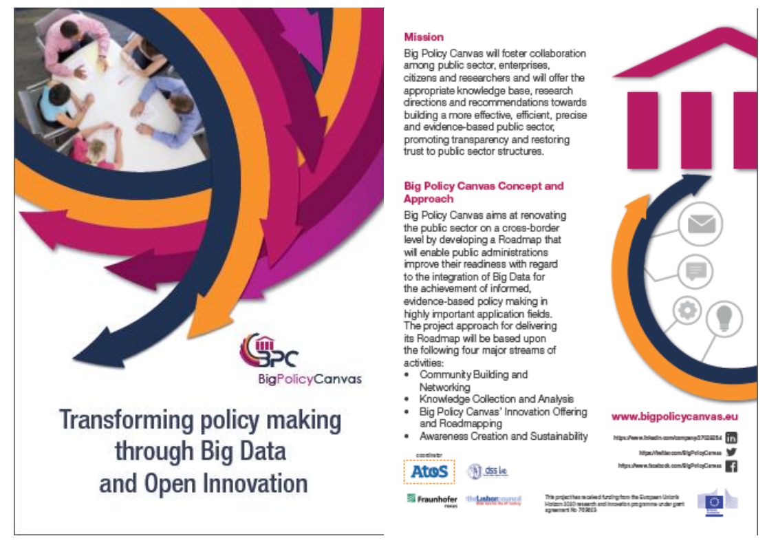
Figure 2-4: Big Policy Canvas leaflet