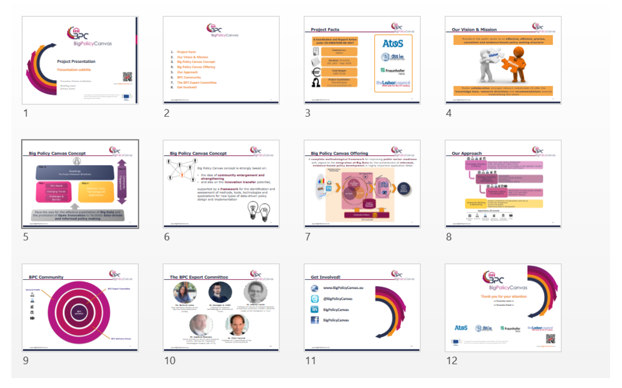
Figure 2-2: Big Policy Canvas project presentation

A Big Policy Canvas project presentation has been created like part of the different dissemination tools designed to support the Big Policy Canvas dissemination efforts. This presentation includes essential information about the project, such as the profile of the consortium, the project concept approach and the BPC Experts Committee. Additionally, it provides information on how to get involved in the BPC network.